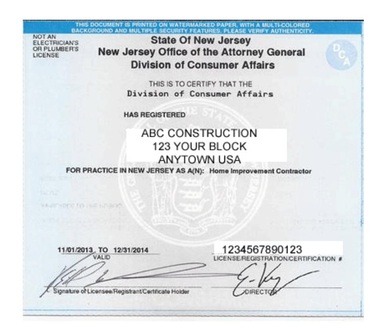
Sample Contractor Trade License

All bidders are to submit with their proposal all current, valid contractor or trade licenses as issued by the New Jersey Division of Consumer Affairs, for any trade or specialty area the contractor seeks to perform work for this particular proposal.